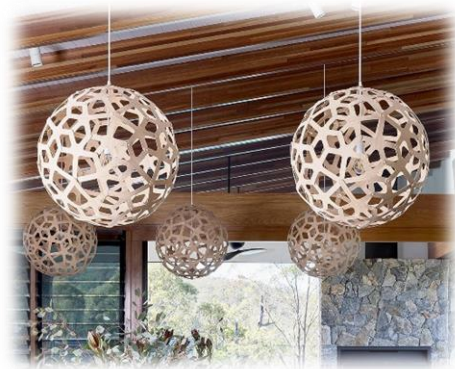
David Trubridge lighting has a team including a French designer