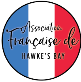
Hawke's Bay French Association